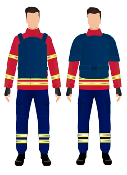
Figure 4. Study of a PCM vest design: ergonomic (left) and enhanced protection (right).

Considering that recent studies determined that the optimum position of the PCM layer was closest to the external heat, PCM packages are being integrated into a vest to be worn over a conventional firefighters' PPE, creating a smart protective clothing system. The design of the vest was studied to protect mainly the torso of the firefighter, preserving ergonomics. However, after some feedback from firefighters, a second version was developed to enhance the protection of the upper limbs (Figure 4).